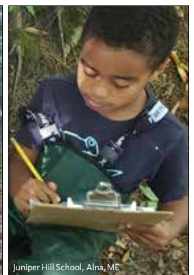
Juniper Hill School, Alna, ME