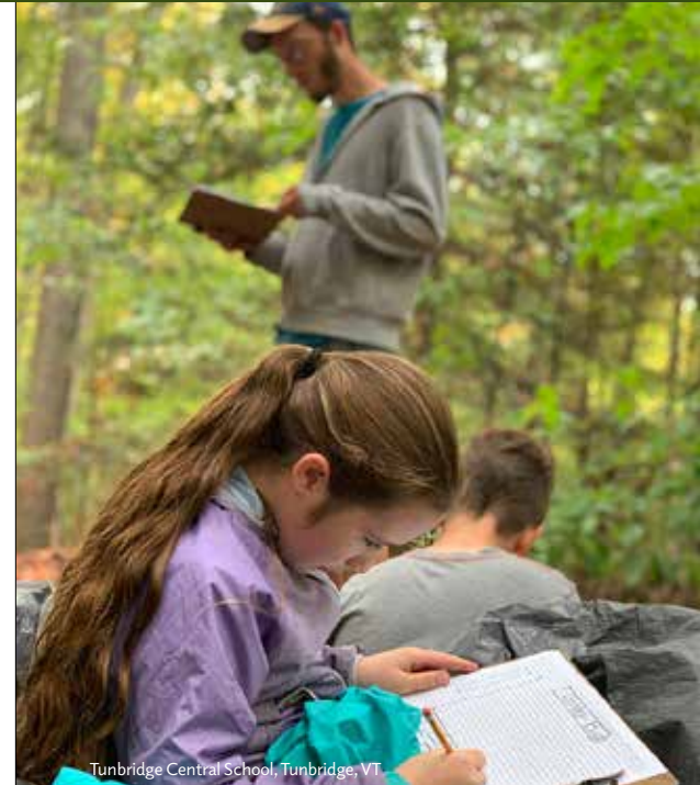
Tunbridge Central School, Tunbridge, VT

Our perspective is rooted in current understandings of the COVID-19 virus and a review of the literature on child development, the benefits of nature-based learning, and mental health resilience.