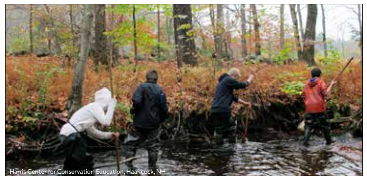
Harris Center for Conservation Education, Hancock, NH

These short documentary films bring nature-based education to life: