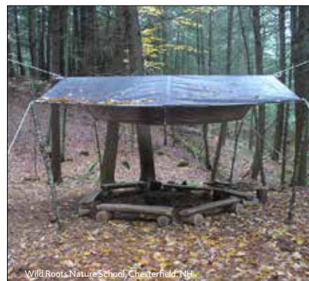
Wild Roots Nature School, Chesterfield, NH

Alternate indoor periods with outdoor blocks of 60 minutes or more. Beyond the healthy option of free-play, activities might rotate between a variety of experiences connected to academic studies and community needs. Project-based learning, trail walking, “sit-spot” mindfulness, gardening, community service projects, scavenger hunts, birding, water investigations, obstacle courses or exercise circuits might be some of the options over time.